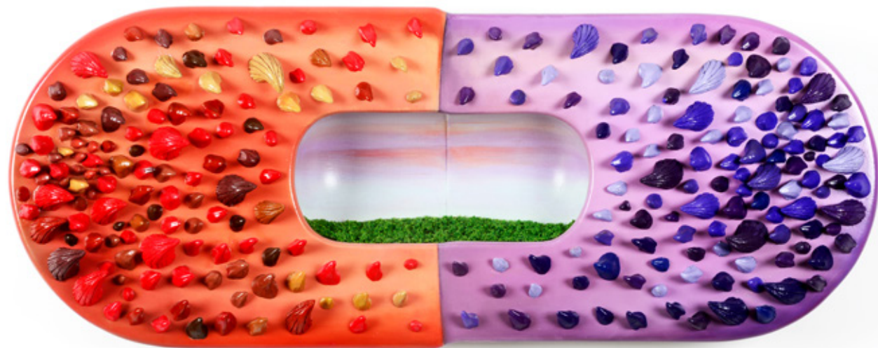
Balm of Gilead , 2016 oil on panel, cast resin thorns, vacuum formed capsule 14"h x 35.5"w x 4"d