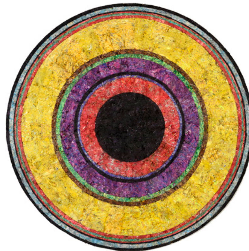
Time Release (Cross Section) , 2016 shredded paper, prescription warnings on panel 5' diameter x 2"d