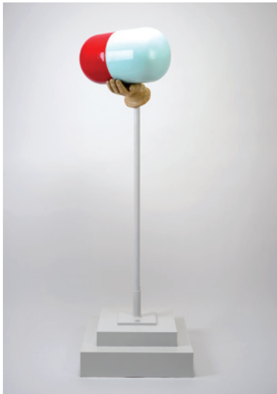
The Great Physician , 2016 vacuum formed capsule, ceramic hand, on wooden pedestal 75.5" H x 22" W x 24" D