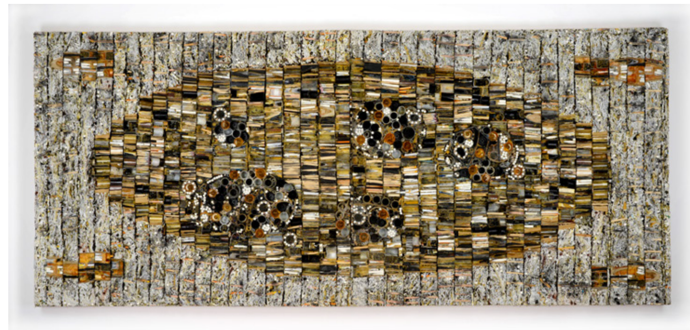
Lenticular Slice , 2010 shredded medical documents, photos, empty prescription bottles 3' 4"h x 7' 8"w x 2.5"d