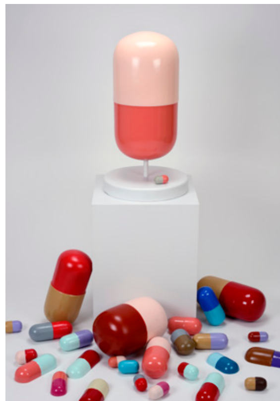
Cure All , 2016 vacuum formed capsules 47"h X 16"w X 16"d