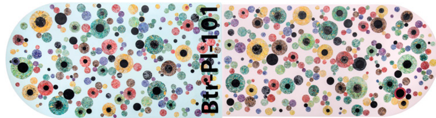
Bitter Pill , 2016 paper, resin 3' 10"h x 14' 1.25"w x 3"d