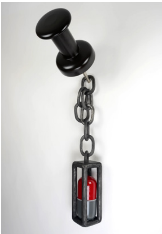
Antidote , 2016 turned urethane foam push pin, stainless steel, carved wooden chain, vacuum formed capsule 3' 4"h x 7' 8"w x 2.5"d