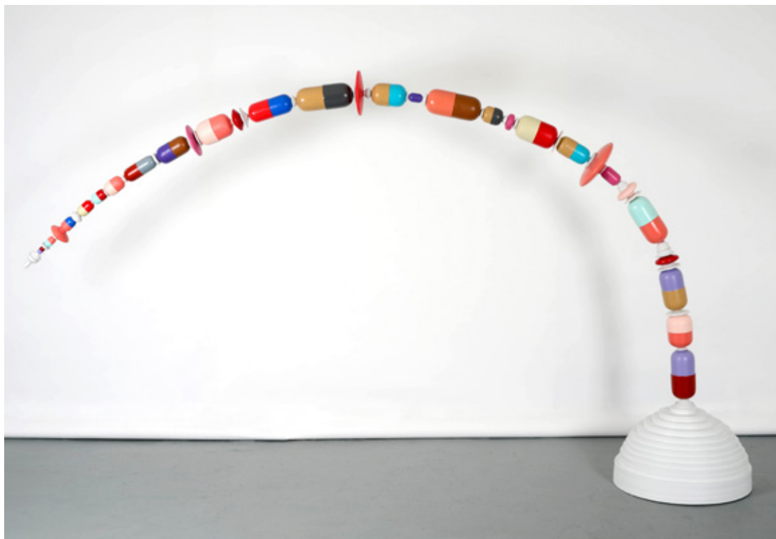
Root of Jesse , 2016 turned urethane foam pills, acrylic paint, threaded rod with pills 3' 4"h x 7' 8"w x 2.5"d